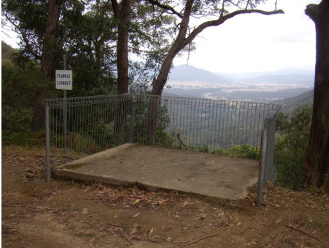
The recently repaired Clarke's Lookout on the Majors Creek Mountain