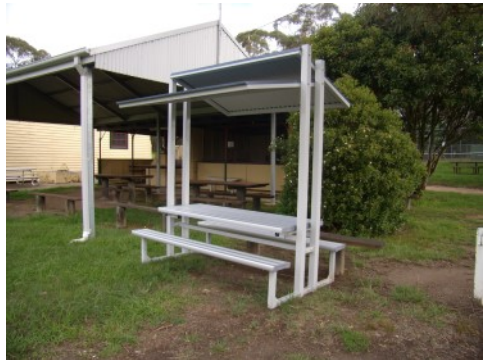
New Sheltered Park Setting on the recreation ground

This Norwegian Spruce has kindly been donated and planted in the recreation reserve. It is hoped in future years it can become a feature at Christmas time.