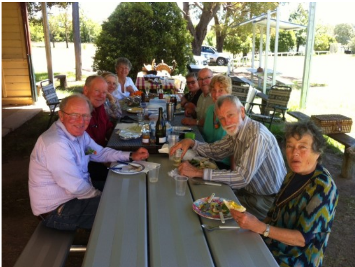
Enjoying a picnic lunch after Church service at St Stephens.

Plans are in hand for the celebration of the 80th anniversary of the formation of the branch in 1939. It is planned to have the function in the Majors Creek Hall in September where the branch was originally formed. The branch meets on the first Wednesday of each Month at 2-00pm and new members are always welcome.